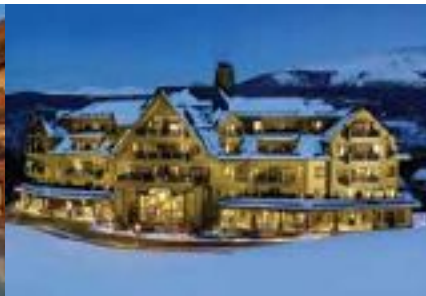
CRYSTAL PEAK LODGE