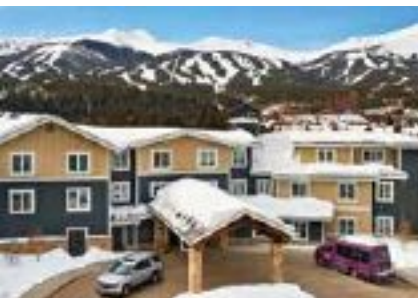
RESIDENCE INN BY MARRIOTT