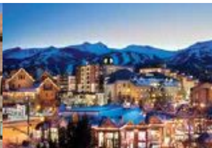
THE VILLAGE AT BRECKENRIDGE