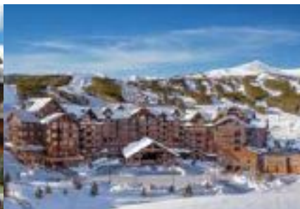
ONE SKI HILL PLACE, A Rock Resort