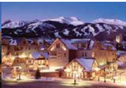
MAIN STREET STATION