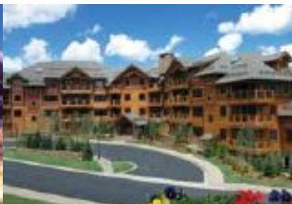
MOUNTAIN THUNDER LODGE