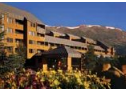
DOUBLETREE BY HILTON BRECKENRIDGE