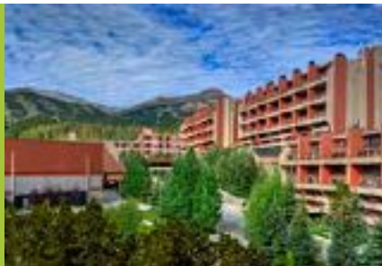
BEAVER RUN RESORT & CONFERENCE CENTER