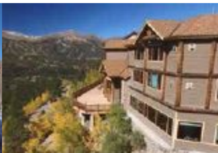
THE LODGE AT BRECKENRIDGE