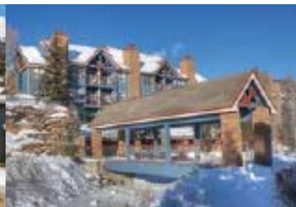
RIVER MOUNTAIN LODGE