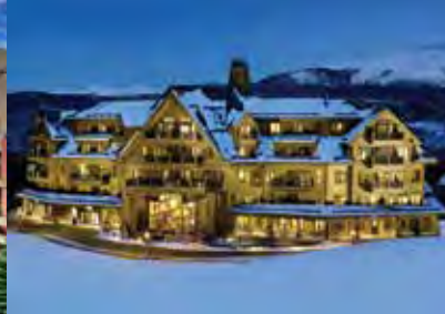
CRYSTAL PEAK LODGE