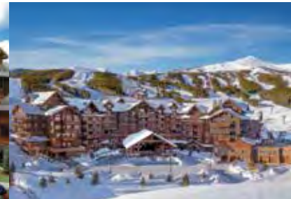
ONE SKI HILL PLACE, A RockResort