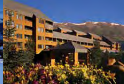
DOUBLETREE BY HILTON BRECKENRIDGE