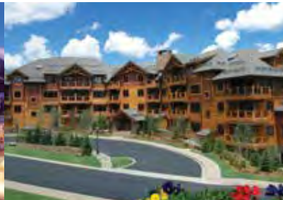
MOUNTAIN THUNDER LODGE