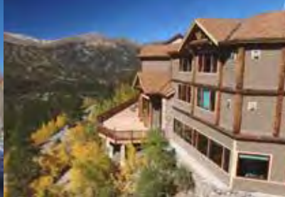
THE LODGE AT BRECKENRIDGE