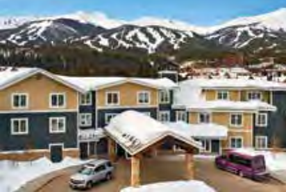
RESIDENCE INN BY MARRIOTT