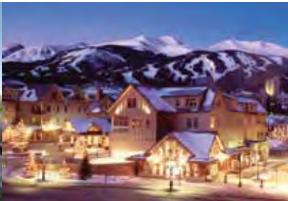
MAIN STREET STATION