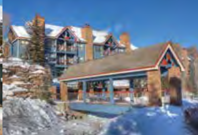
RIVER MOUNTAIN LODGE