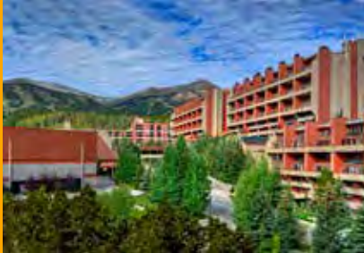
BEAVER RUN RESORT & CONFERENCE CENTER