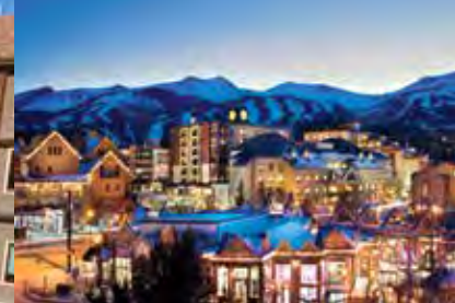
THE VILLAGE AT BRECKENRIDGE